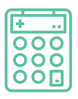
Table 3 Change Charges